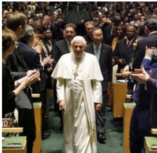
Permanent Representatives and delegates welcome His Holiness at the General Assembly.