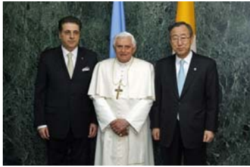
Secretary-General Ban Ki-moon (right) and Srjjan Kerim (left), President of the sixty-second session of the General Assembly, welcome His Holiness Pope Benedict XVI, upon his arrival.

25 East 39th Street New York, NY 10016 Phone: (212) 370-7885 Fax: (212) 370-9622 E-mail: office@holyseemission.org