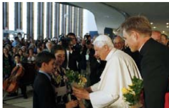
United Nations International School Students welcome His Holiness Pope Benedict XVI.